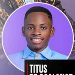
TITUS DE PSALMIST